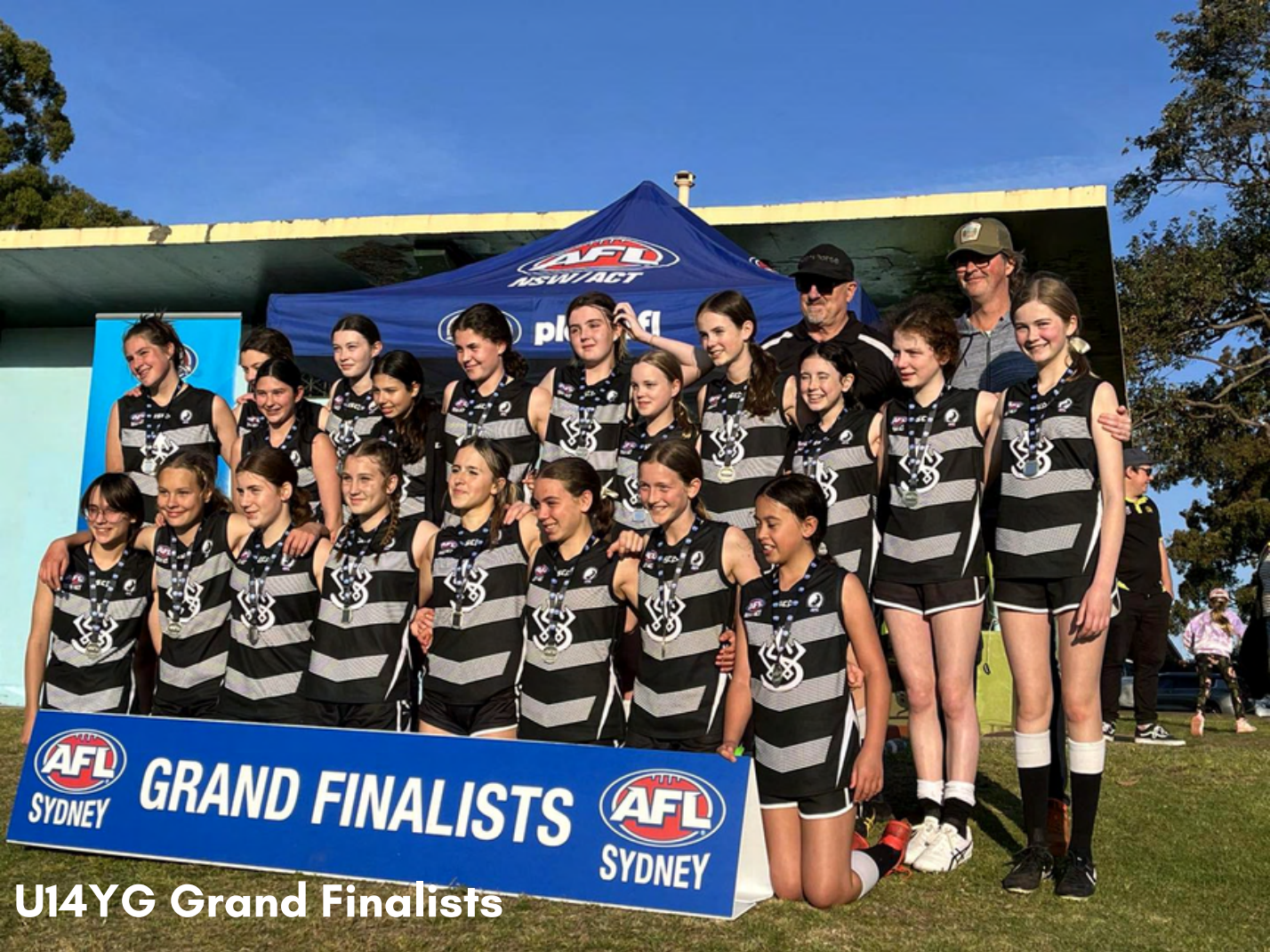
U14YG Grand Finalists