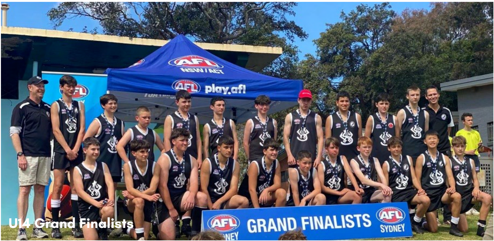
U14 Grand Finalists