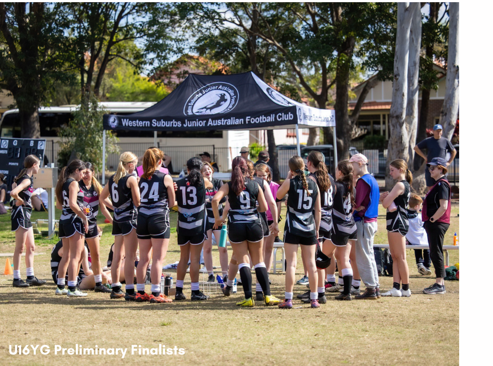
U16YG Preliminary Finalists