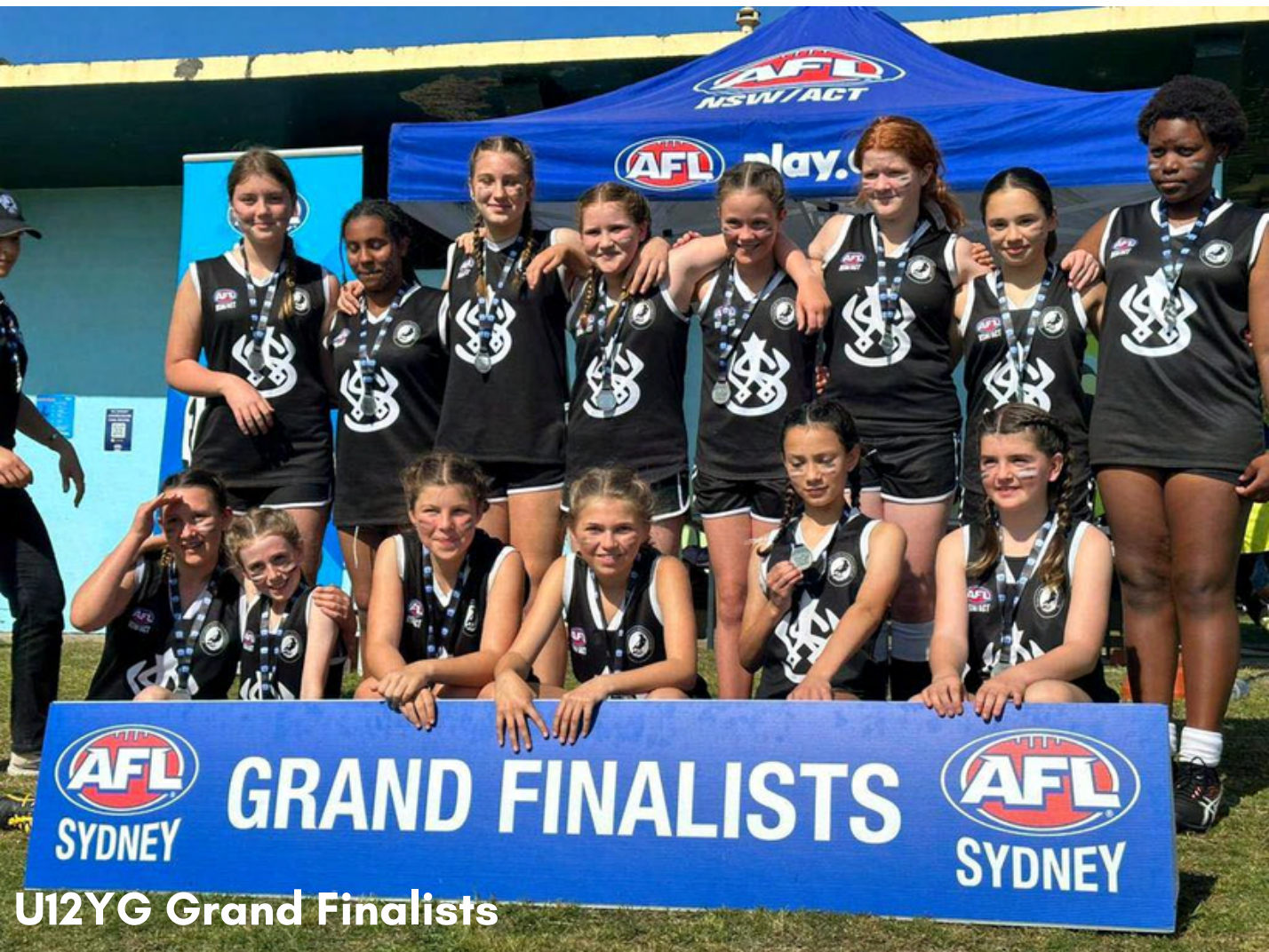
U12YG Grand Finalists