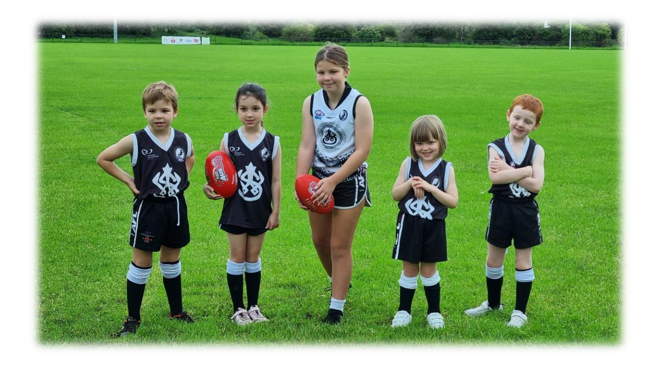
See you next year!